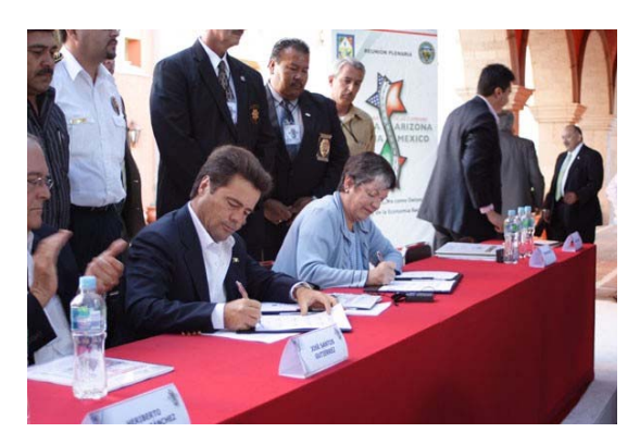
Sonoran Governor Bours & Arizona Governor Napolitano sign resolutions adopted at the Plenary Session.