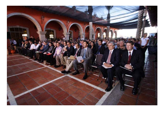
The audience witnessing the proceedings at the Plenary Session held at the Condominios Las Palmas . in Rocky Point.