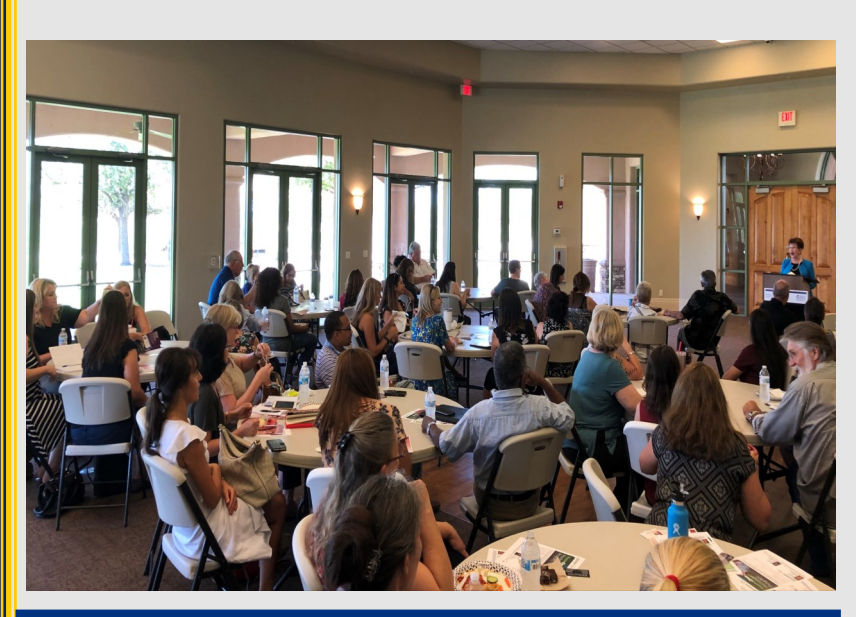
Commissioner Lowe's visit at West USA Realty Lunch & Learn

ADRE presenting recent process improvements and results to Governor Ducey