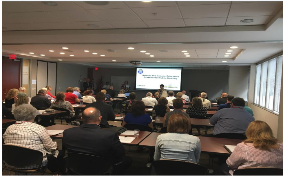
Arizona Pre license Education Stakeholder/Public Meeting, July 26, 2018

Many thanks to the real estate professionals, educators, public, and all those interested who participated in the AZ Pre-license Education Stakeholder/Public Meeting!